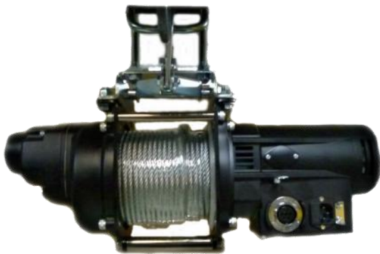
Winch with optional Hanger Attachment for Lifting applications